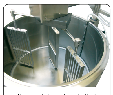
Three part cheese harp (option)